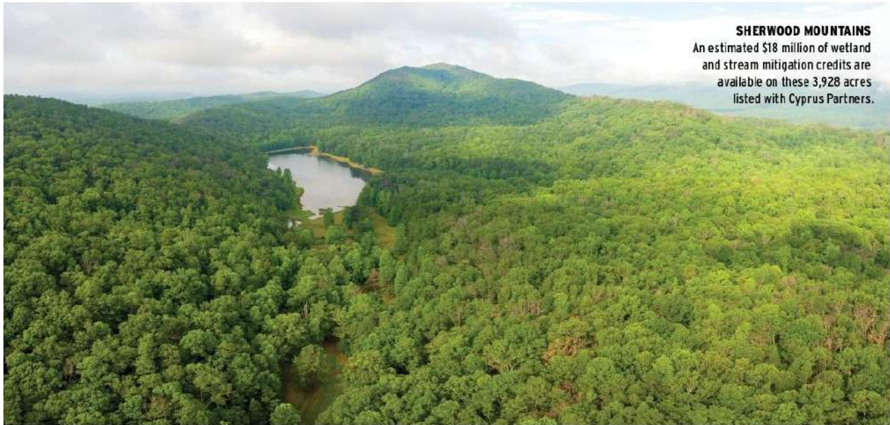
SHERWOOD MOUNTAINS An estimated $18 million of wetland and stream mitigation credits are available on these 3,928 acres listed with Cyprus Partners.

with regard to small to medium tracts, preferring those within 90 minutes of metropolitan areas.